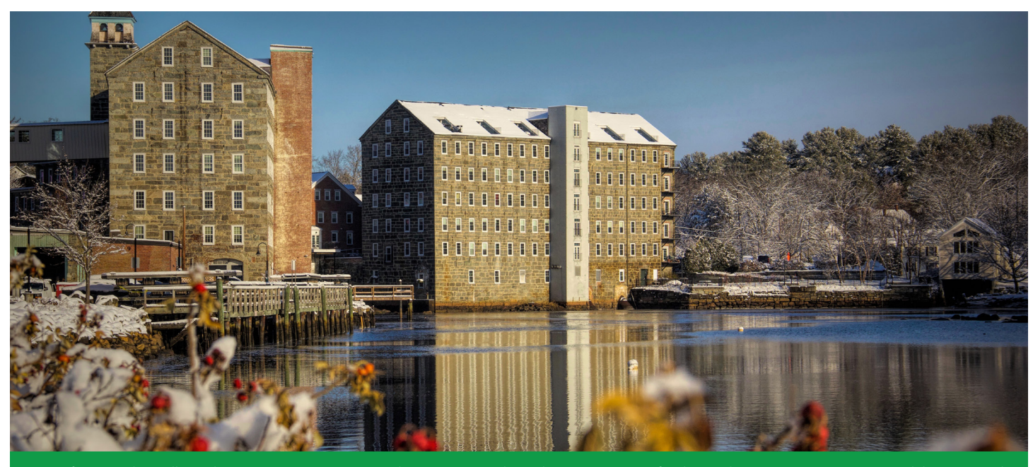
home to a diverse ecosystem. The bay is protected by the Great Bay National Estuarine Research Reserve and the Great Bay National Wildlife Refuge.