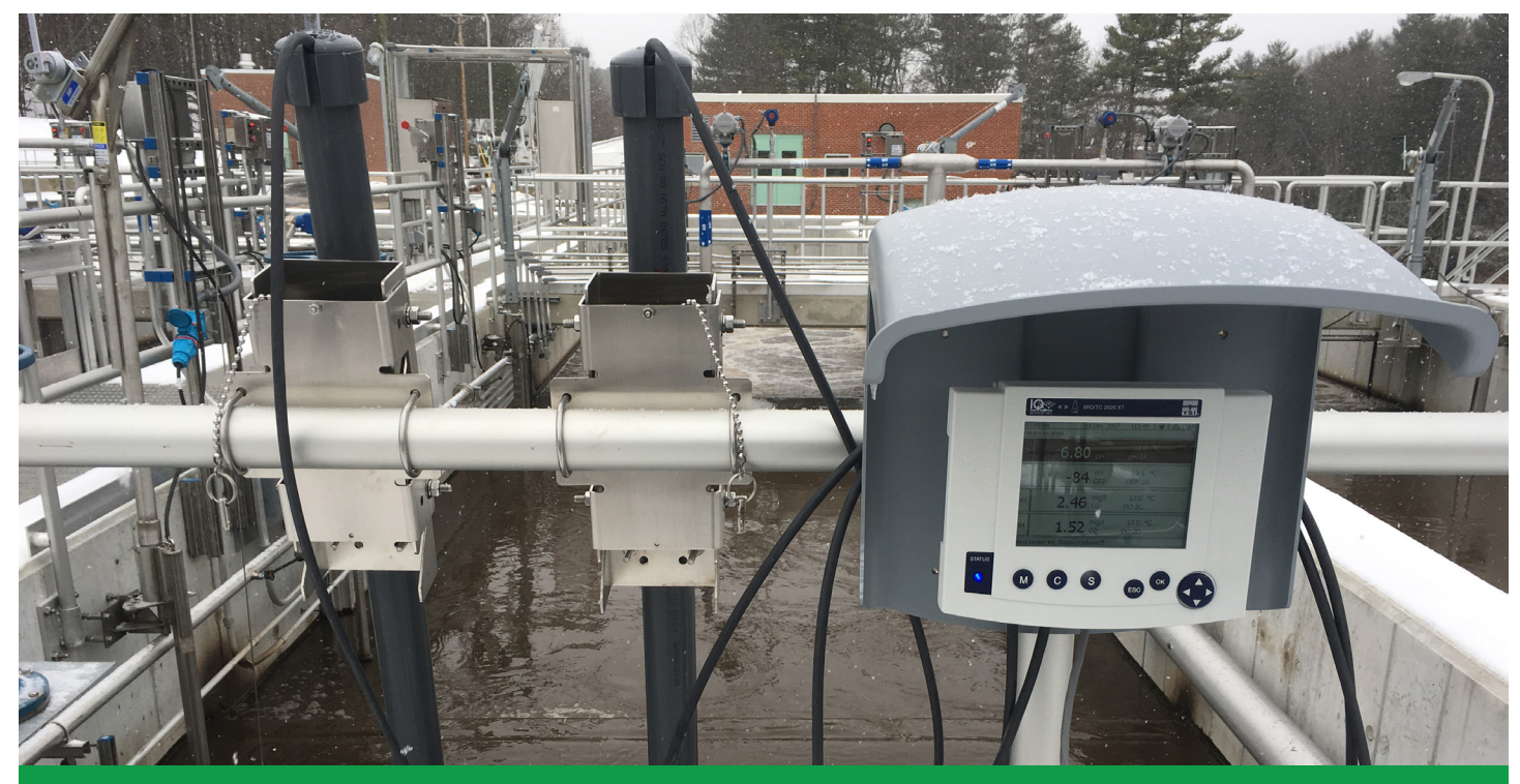
IQ SensorNet utilizes one controller to monitor up to 20 parameters on a single network. Newmarket decided to use two IQ controllers (one on each train) to monitor all 18 sensors in their activated sludge process.

Another benefit that stood out during the selection process was IQ SensorNet's wireless capabilities. Wireless radio communication allows technicians to install their sensors anywhere in the facility and reduce challenging cable runs. Newmarket also knew they would want to add to the system over time, so adding new measuring locations in the future would be exceptionally easy.