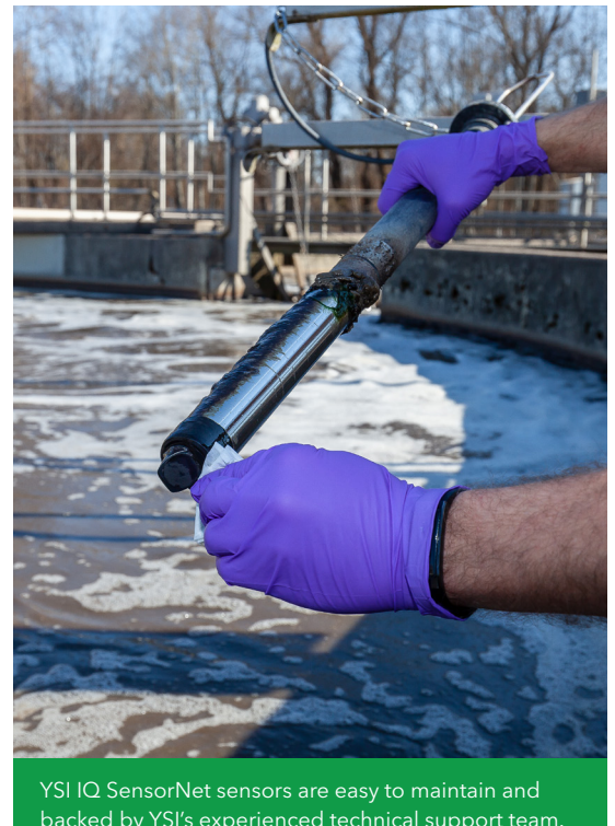
backed by YSI's experienced technical support team.

YSI, a Xylem brand 1725 Brannum Lane Yellow Springs, OH 45387